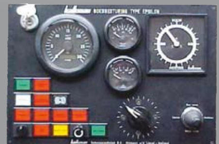
Switchbox and operating panel in various versions