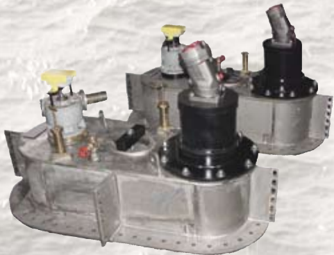
Also available in stainless steel