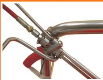
Stainless steel top-frame with gun rest / lance holder.