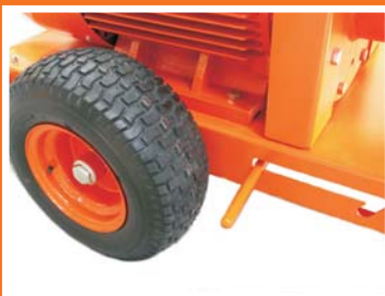
Galvanized frame with built in brake and pneumatic wheels.