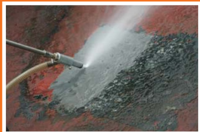
Surface - Sand Blasting