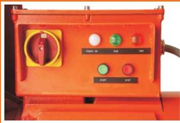
Die cast electrical box with main switch and overload relay.