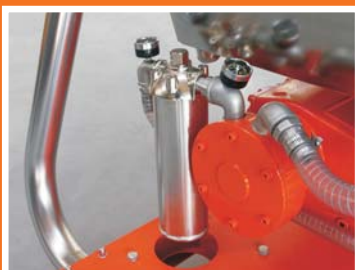
Integrated booster pump & filter system.