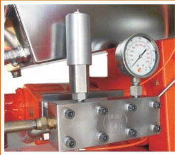
Stainless steel pump-head. Integrated cooling for plunger-seals.