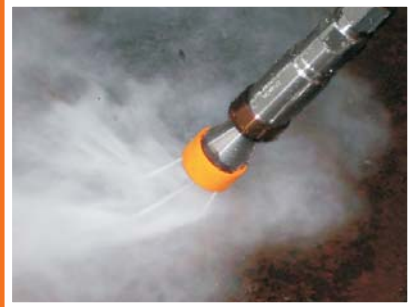
Ultra Impact Rotating Nozzle