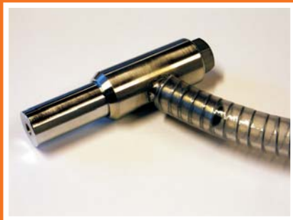
Sand Blasting Equipment